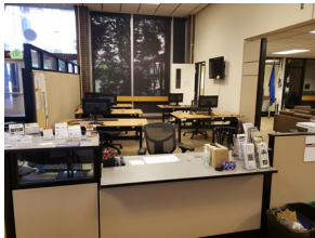
Computer and Printer Resource Area