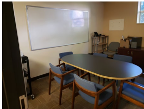
Tutoring and Group Study Area