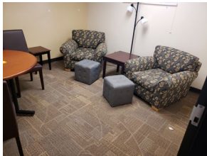
Quiet Study Area